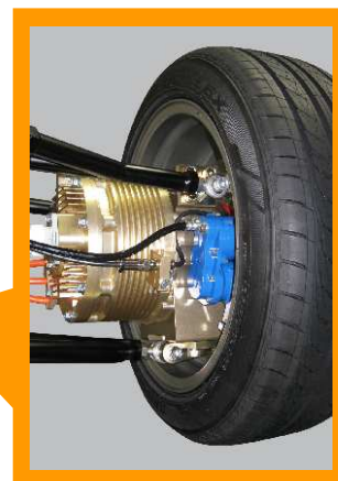
Intelligent in-wheel developed by NTN

For further information on this new product, access the following URL: