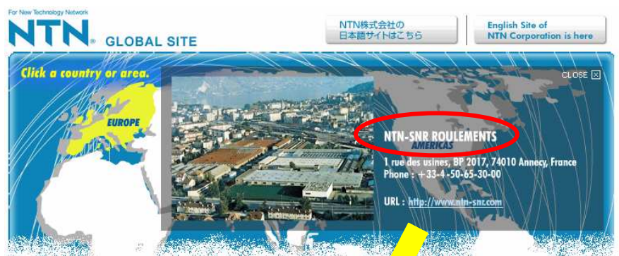
NTN global website

In order to reinforce the network of development, production and sales, SNR ROULEMENTS has decided to change its company name to NTN-SNR ROULEMENTS on July 22 (Thu) with a decision of the general shareholders' meeting.